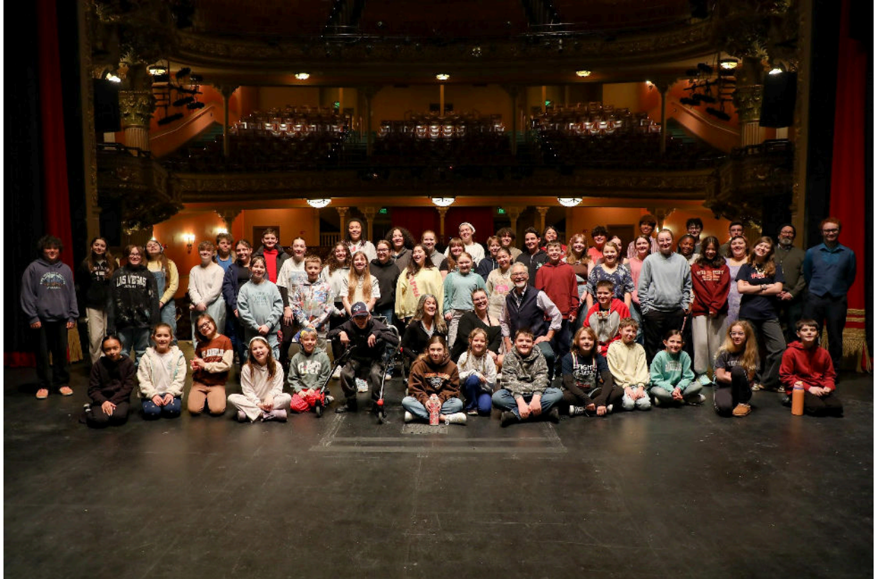
Cast of the BTG production of Roald Dahl's James and the Giant Peach