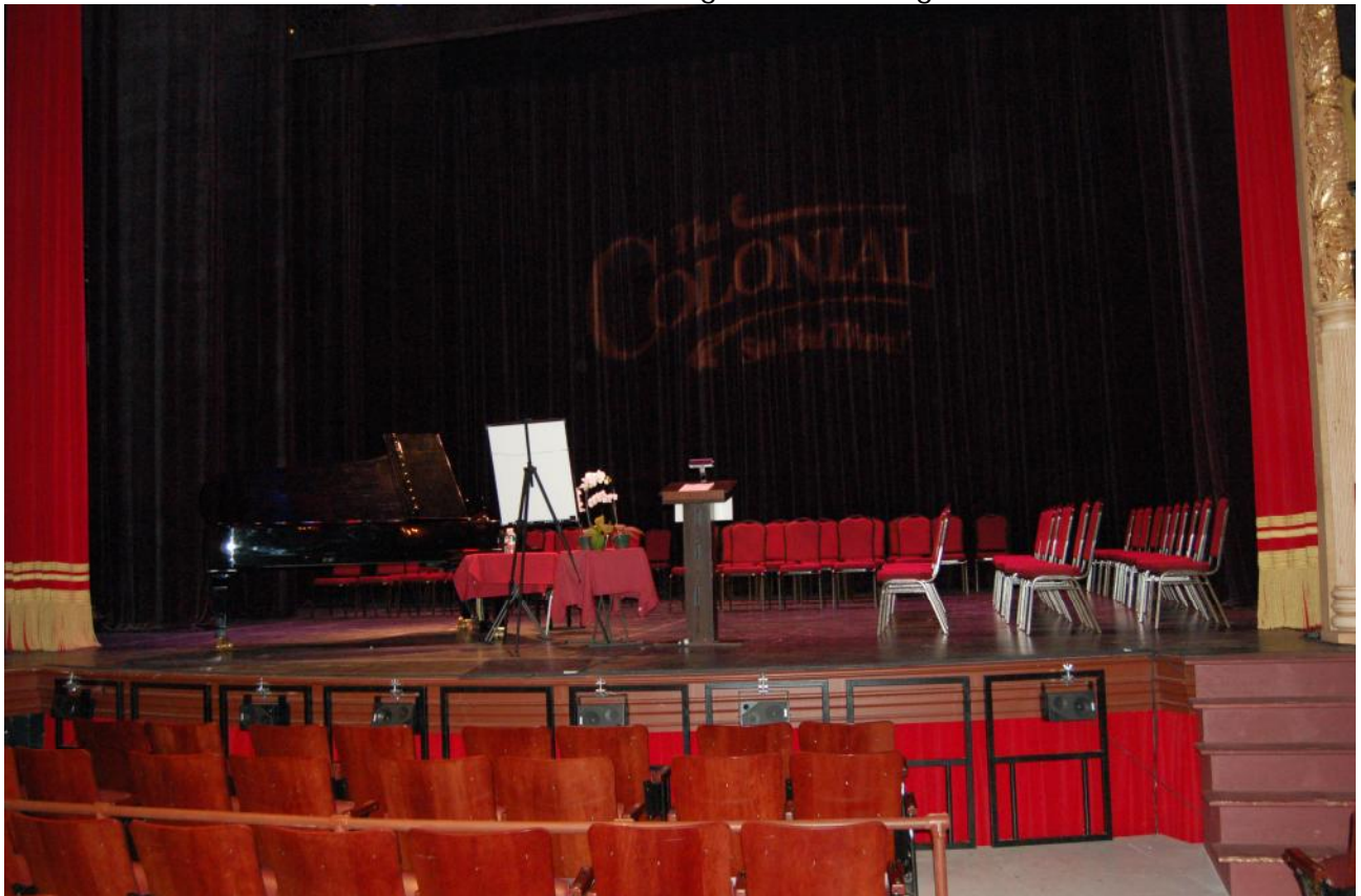
Small Cocktail Party: